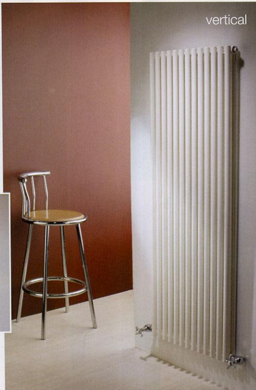
Volcano double vertical 1471 x 520, shown in RAL 9010 with Crosshead valves.

See page 83 for the matching Volcano Towel Rail.