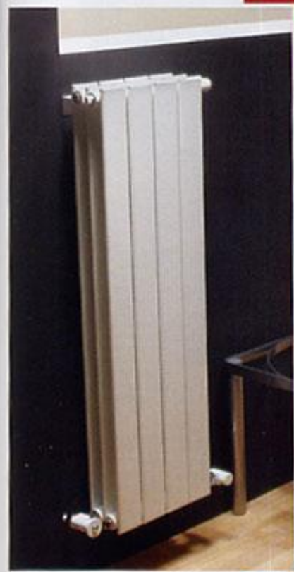
Picchio Triple 1010 x 343 in RAL 9010

The Picchio Triple delivers extremely high outputs and is great for tight vertical and horizontal spaces.