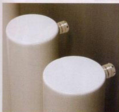
70mm tubes shown in white RAL 9010 with Aladdin Micro vents

Available in 1, 2, 3 or 4 70mm tubes, the Tower captures your eye with its simple, yet striking, linear design.