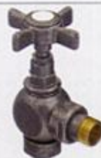
Mottled Silver Crosshead

Painted valves are an excellent choice when complementing your Volcano or Tornado radiators, giving a stunning finish, exclusive to these radiators. See page 94 for details.