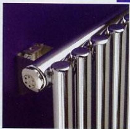
22mm round cross tubes shown with auto-airvent.

The new TRC Chrome replaces the popular Norte and has higher outputs. This slim stylish model comes with B2 connections and is available from stock in a wide range of sizes for immediate delivery.