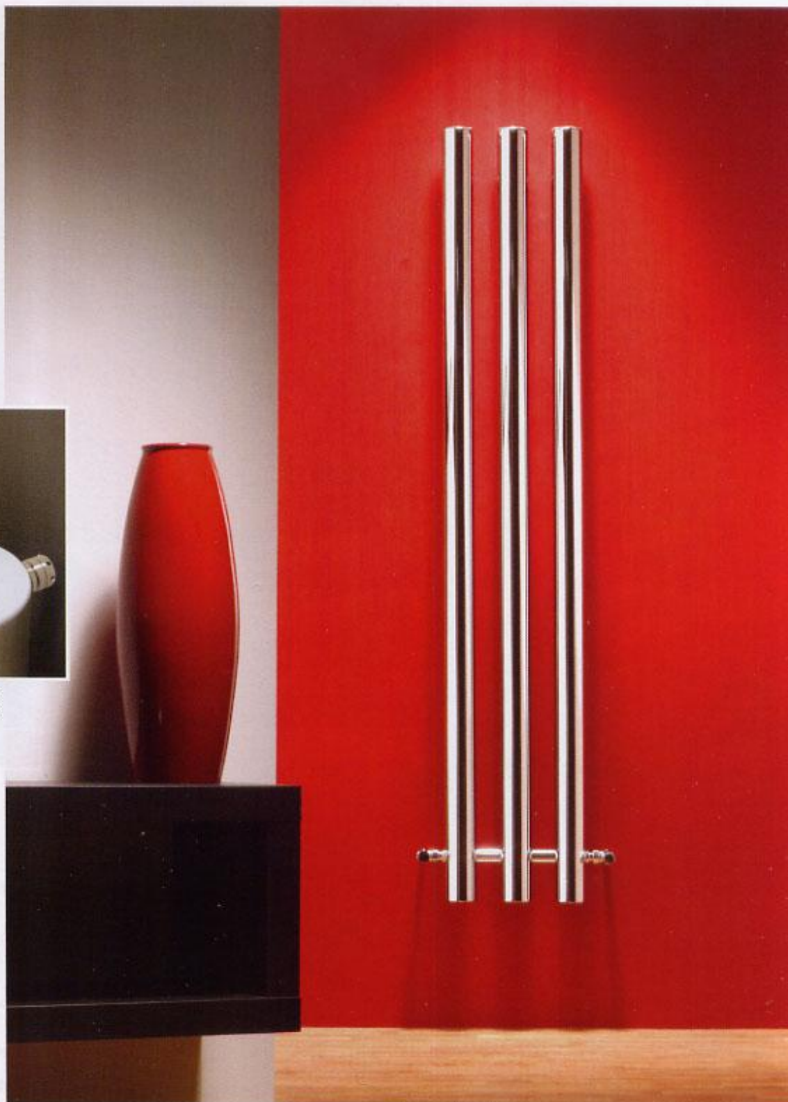
Tower 1700, 3 tube (203) shown in Chrome with Cylinder valves.