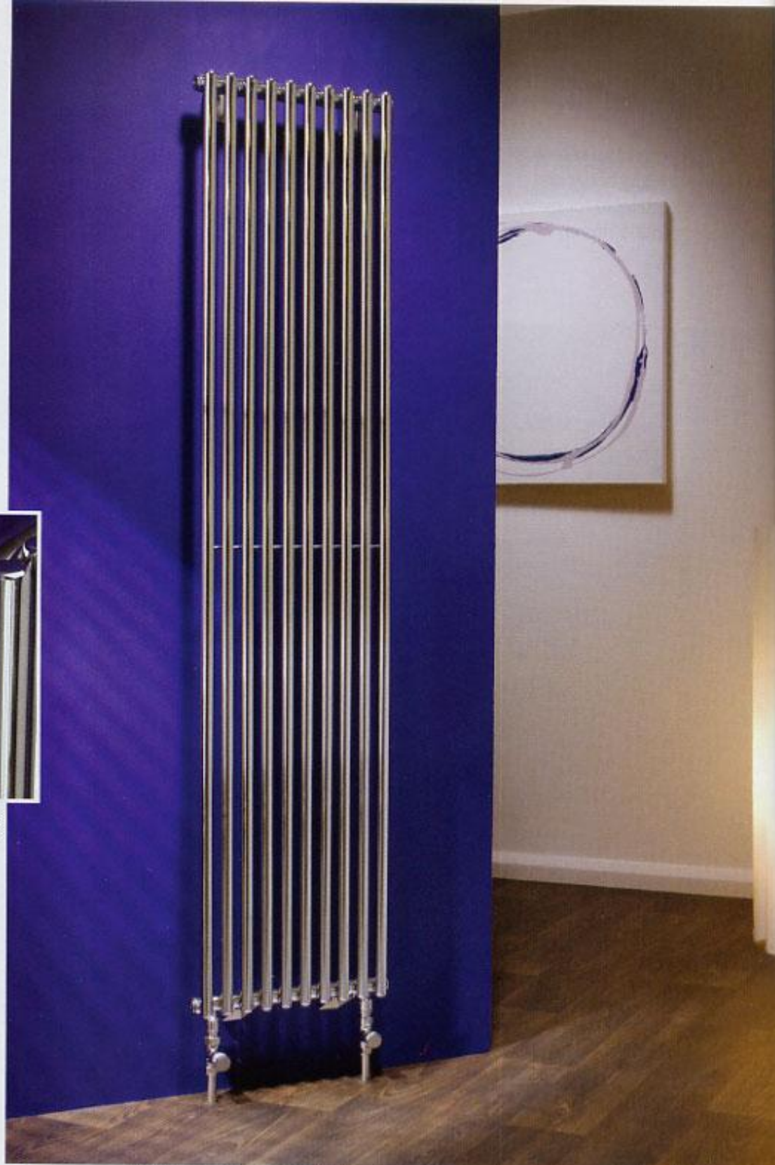
TRC Chrome 1600 x 356, finished in chrome with B2 connections shown with Tondera valve