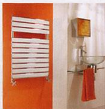
TRC Bath Flat see page 81 for details.